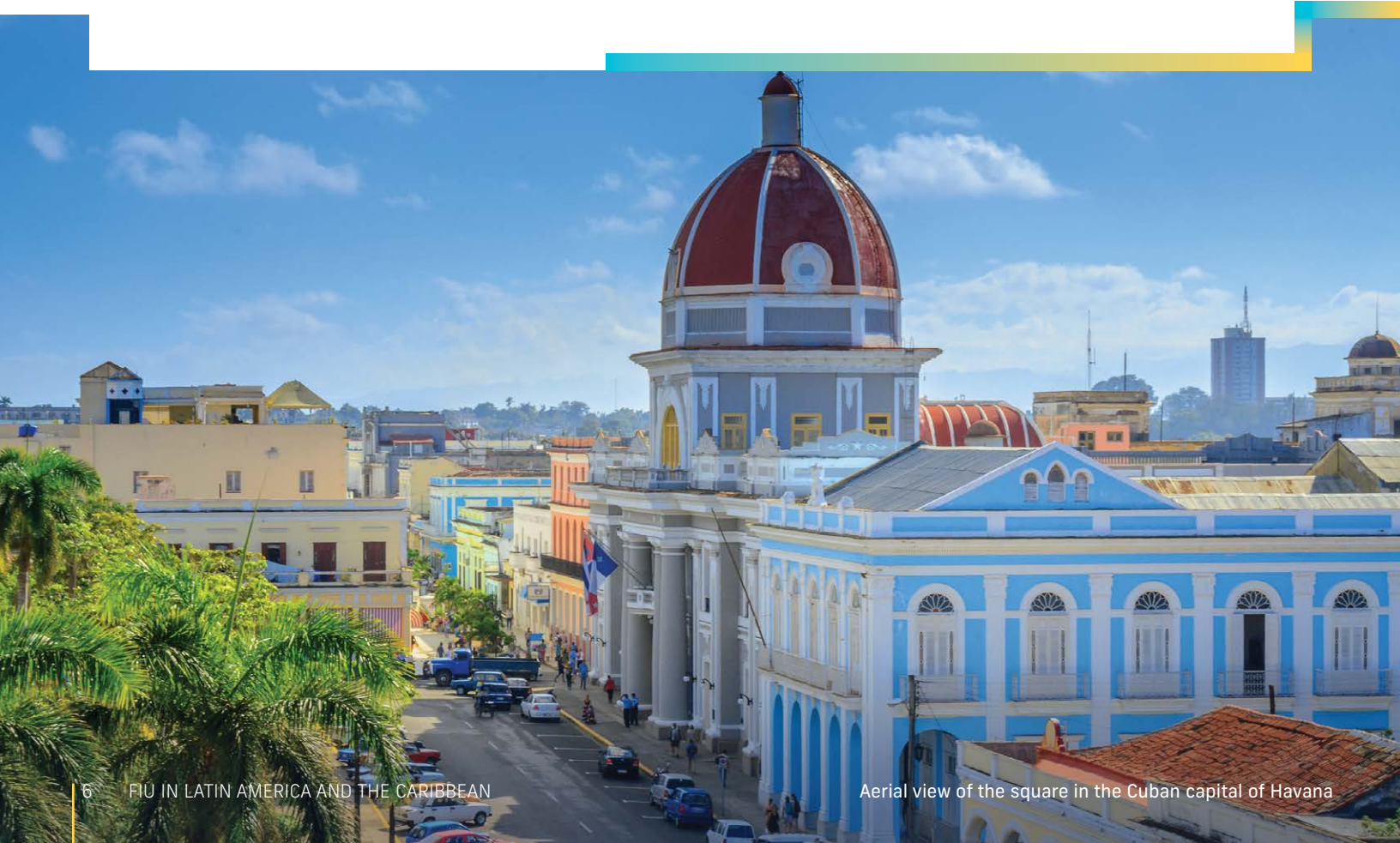
Aerial view of the square in the Cuban capital of Havana

Nearly half of the people of Haitian descent living in the U.S. reside in Florida and no other county in the nation has as large a Haitian community as Miami-Dade County. FIU teaches Haitian creole and provides specialized interdisciplinary training on Haiti and the Haitian Diaspora while facilitating academic and professional development for those working in and on Haiti. With collaboration from the Inter-American Development Bank (IDB), FIU has worked toward producing results in the improvement of water availability, quality, and integration of water resources in Northern Haiti. Our researchers use innovative, practical approaches to hydrological technologies, along with strong institutional relationships to produce results and are able to replicate the solutions in other regions.