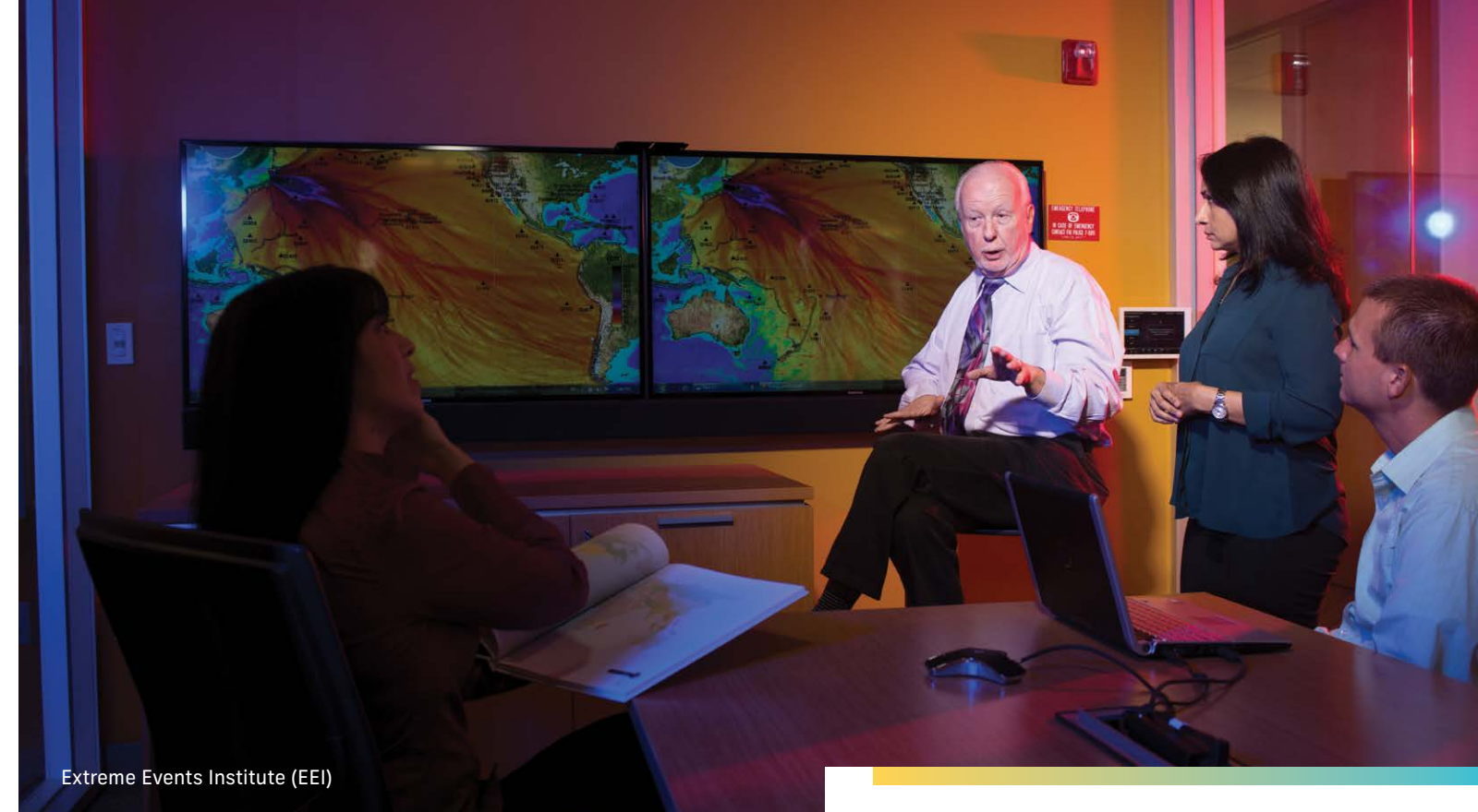
Extreme Events Institute (EEI)

Global collaborators in academic institutions, NGOs, governments, and the private sector have long recognized FIU's leadership and international influence in the field of tropical conservation. The institute is directly implementing species conservation and recovery projects while developing research and education programs that prioritize species and ecosystem protection in tropical and sub-tropical species and their habitats. Researchers address the critical issues driving wildlife extinctions and declines in biodiversity-rich ecosystems– including habitat loss, wildlife trade, climate change, natural resource depletion, and other anthropogenic factors.