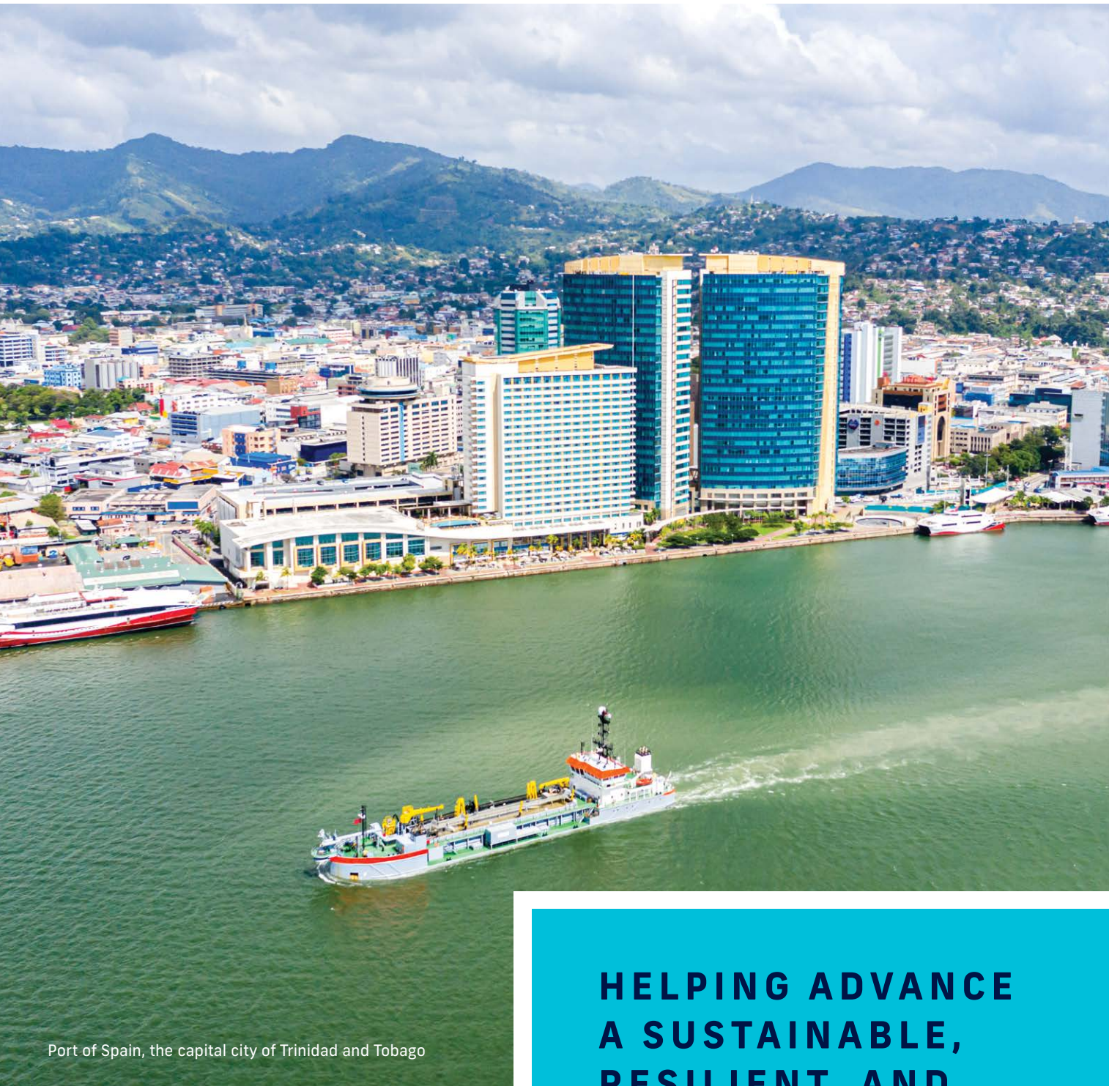
Port of Spain, the capital city of Trinidad and Tobago